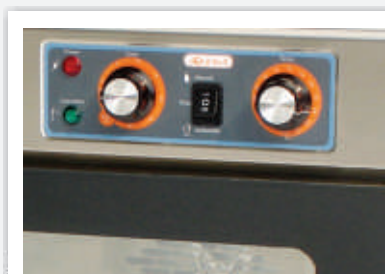
1. Automatic (Time) or manual (Temperature) mode available