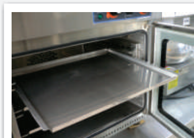
3. 3-level built in S/S trays for mass production (400x350mm)