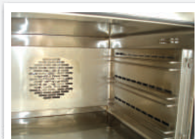
2. Removable pan holder for easy cleaning